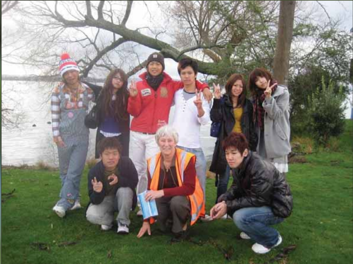
Japanese students are regular volunteers.