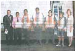
TEAM MAX: The Fordehills Community Max Team won their award for cleaning up the suburb's parks and reserves.