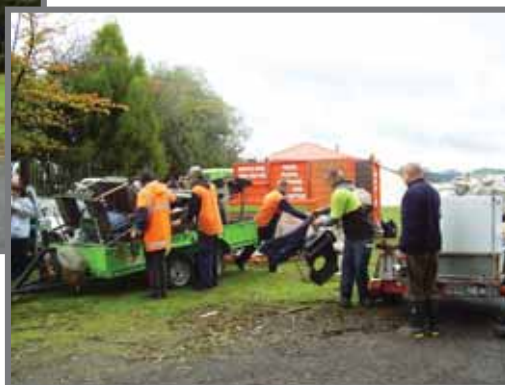
Kiwi Commodity Recycling Solutions