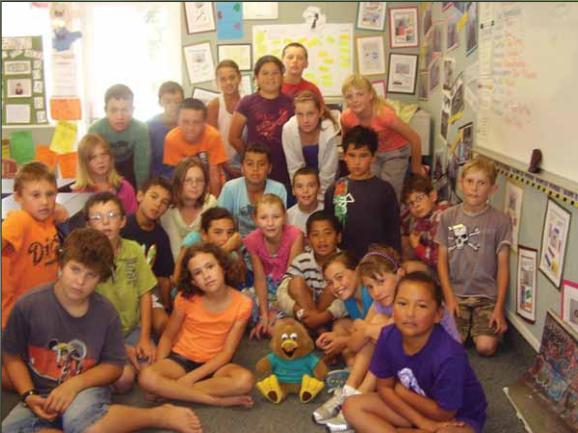
Westbrook School children with Horace the Keep Rotorua Beautiful mascot

Not all schools participate every year. Many tie the talk in with Clean up week.