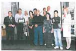
HAPPY NAPS: Te Puna Aoranga's Ngati Whakaue receives their award from the mayor and mayorress.