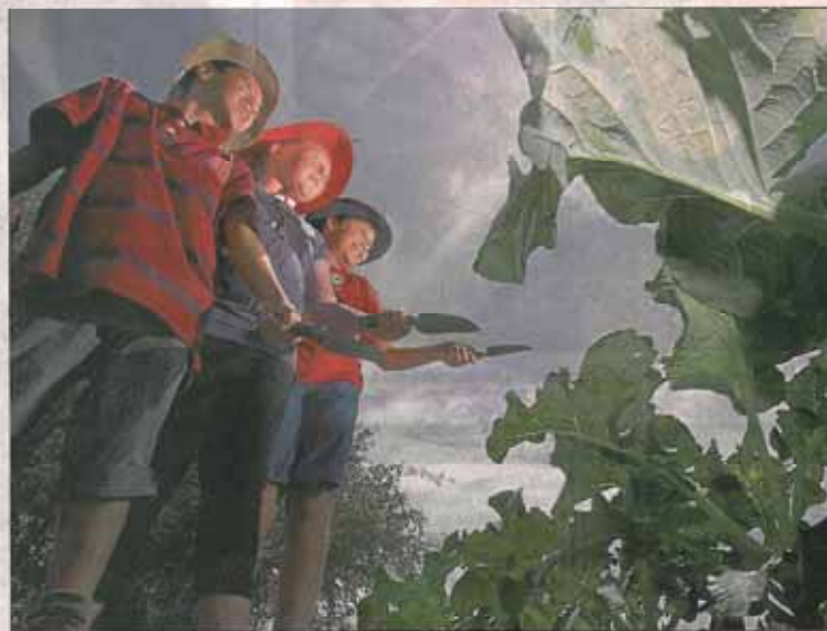
GREEN: Selwyn School pupils want to win the Keep New Zealand Beautiful top school award.

She said the school's environmentally-based projects included a large community garden, school-wide recycling programmes, composting, street clean-ups and helping the council